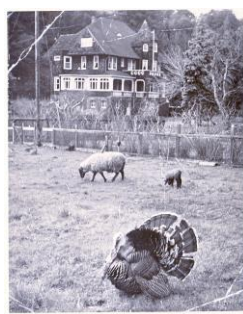
Turkey Bowl in 1940's