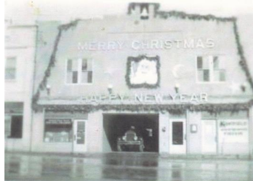
2 1/2 " x 3 1/2 " Kent Market Calendar Kentfield Fire Department decorated for Christmas Party 1940's