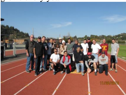
Turkey Bowl team 2013

Every year since then "The Turkey Bowl" games have been held on all the local fields...Kent, Bacich, Redwood, Piper Park and now the Bowl is hosted at College of Marin. We haven't been kicked off there yet because that field has already been classified as "hazardous" and we're all insured now so no one cares. This year is our 50th "The Turkey Bowl" and we still expect to see a good group of originals, offspring and friends out for the game...Now, almost all attendees are old guys, we play by touch football rules and two-toned Footjoys are sometimes substituted for Riddell speed cleats. Many players are well over 60 and still play all four quarters but the quarters are much shorter and the number of retired "official assistant coaches" lounging on the sidelines grows every year.