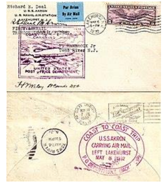
Cover carried on the May 1932 "Coast to Coast" flight and later autographed by the only three survivors of the April 1933 crash of USS Akron.