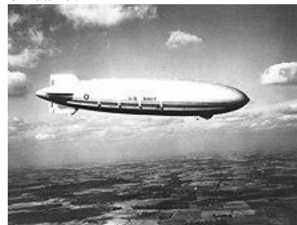
The maiden voyage of Akron on 2 November 1931, showing her four starboard propellers. The engines' water reclaiming devices appear as white strips above each propeller. The emergency rear control cabin is visible in the lower fin.

On the appointed day we all gathered at the foot of the lane that led up to the Dollar estate, and following a whistle blown by our principal, Miss Palmer, we began our trek up the winding lane, finally reaching the estate house. I don't really remember how we reached the top from there, as the lane stopped at the house, but I can surmise that the group wended its way through the foliage, finally arriving at the treeless top without undue stress. For us kids, it had to have been a piece of cake!