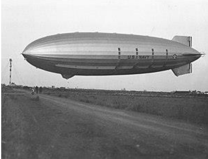
USS Akron (Wikipedia)

It all started when the announcement was made by my sixth grade teacher that we would soon have a day off from school to be able to view an over flight of the famous airship, the Akron . This is only conjecture on my part, but in retrospect, I can only imagine that the school was notified of this momentous occasion so as to allow enough time for the interested parties to position themselves in the line of flight. It was, we were told, to fly over Kentfield, and then to San Rafael, over to Hamilton AFB, and probably then, back to its hangar at Sunnyvale. Its track over Kentfield was to be, miracle of miracles, almost directly above my house on #12 Cypress Avenue, and my joy knew no bounds!