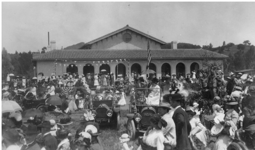
Tamalpais Centre in the 1909

Earlier this year one of our board members was contacted out of the blue asking if the Kentfield Greenbrae Historical Society was interested in obtaining a folder of documents relating to Kentfield around 1908 until the early 1920's. The documents include copies of founding papers for the Tamalpais Centre.