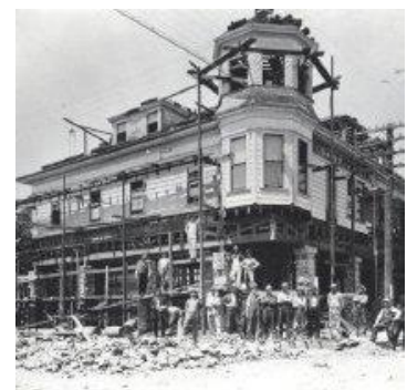
Building Blue Rock Inn