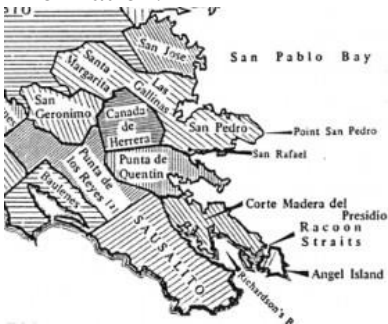
Punta de Quentin Land Grant