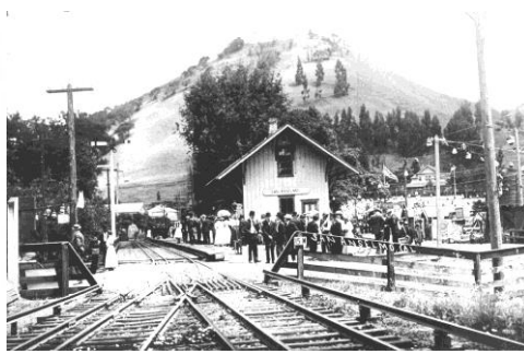
San Anselmo Hub