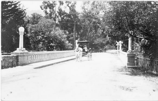
Lagunitas Bridge with Lights

The two organizations consolidated in 1994. Today the unique and charming Octagon House continues to serve as the Moya Library, complemented by a wealth of historical resources. An important ongoing activity is our First Friday Forenoon Programs ~ Presentations are given by authors, artists, scholars, experts in a given field, and in a variety of interesting topic areas. Check our website for details of upcoming guests.