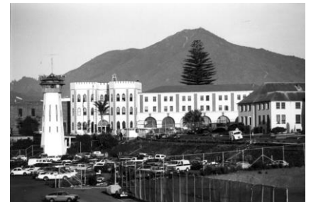
Old San Quentin

Visitors will need to show ID at entry gate. No cameras or cell phones with cameras allowed. NO BLUE JEANS!