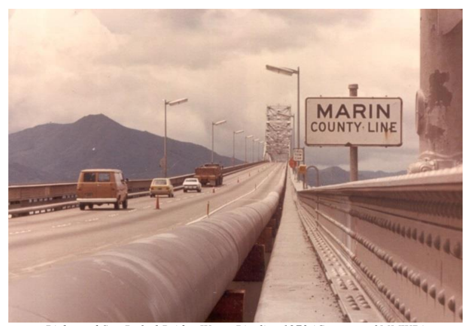
Richmond San Rafael Bridge Water Pipeline 1973

According to the Marin IJ, Kentfield has had 14.75" of rain this year, 27.66" last year, compared to an average of 47.48" yearly normal.. When I was growing up in Kentfield, my father was a rain gauge fanatic, recording 82" during one of the heavy rain seasons. We seem to be having fewer floods and more droughts as climate change takes its toll. We in Marin live in a self sustained water system, relying on our reservoirs for water, and they are already drying up. We have the added anxiety of projected wild fire season with all the dry hillsides, and the lack of water to fight them. Please share with us your suggestions to save water, protect our community and prevent wildfires. <a href="mailto:info@kghs.org">info@kghs.org</a>. We will post them in the next newsletter and on our website.