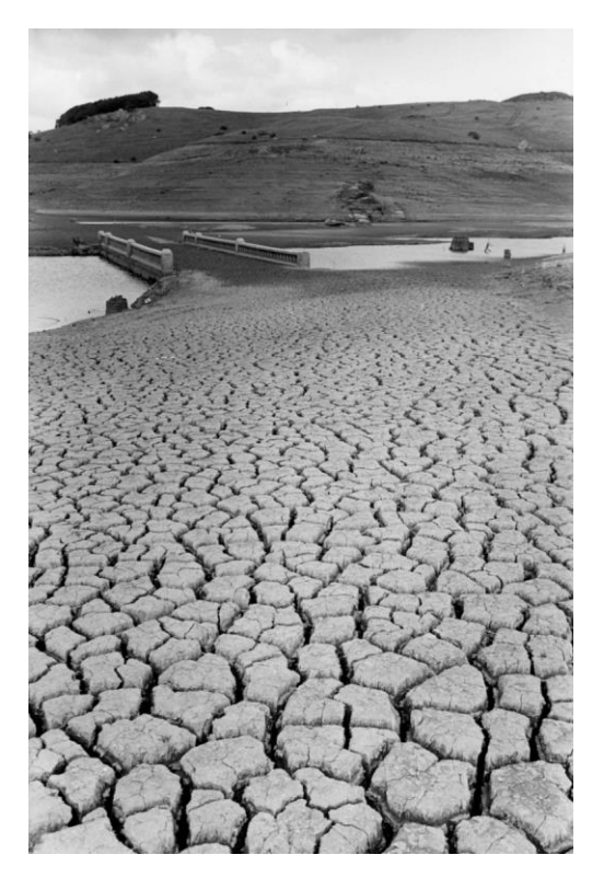
Nicasio Reservoir 1976

According to the Marin IJ, Kentfield has had 14.75" of rain this year, 27.66" last year, compared to an average of 47.48" yearly normal.. When I was growing up in Kentfield, my father was a rain gauge fanatic, recording 82" during one of the heavy rain seasons. We seem to be having fewer floods and more droughts as climate change takes its toll. We in Marin live in a self sustained water system, relying on our reservoirs for water, and they are already drying up. We have the added anxiety of projected wild fire season with all the dry hillsides, and the lack of water to fight them. Please share with us your suggestions to save water, protect our community and prevent wildfires. <a href="mailto:info@kghs.org">info@kghs.org</a>. We will post them in the next newsletter and on our website.