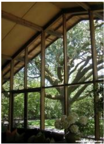
Joseph Esherick Mid Century Modern 1950 Kent Woodlands Home