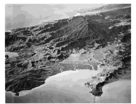
Aerial View of Corte Madera Creek Basin, Mt. Tam and San Quentin Peninsula