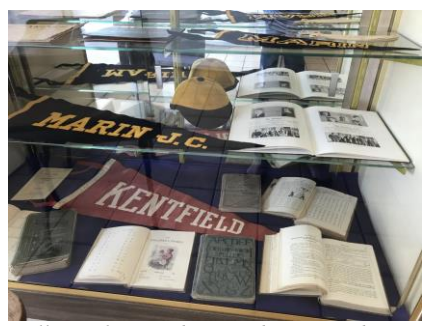
College of Marin banner, beanie and yearbook; Kent Banner and early primers and textbooks

The Marin History Museum has generously loaned historical artifacts for display in our Pop Up Store at Bon Air Center. Be sure to check out the window and visit us on May 5! They will be on loan through October 2018.