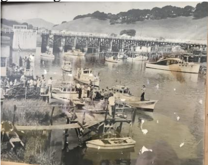
"50/50" members purportedly lived on both sides of the creek before the current 101 overpass replaced Peterson Bridge and eliminated the last homes on the creeks N/E bank. Aka 50/50.

Many of its founding members were previously known as the "The Fifty-Fifty Club" which was an association of creek-side dwelling working men who loved hunting, fishing, habitat preservation and congenial gatherings.