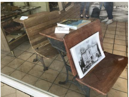
Two children's school desks with inkwells ... one from the 1800's and one from the 1900's.