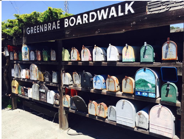
Greenbrae Boardwalk Mailboxes

The Greenbrae boardwalk, which borders the Corte Madera Creek on the east side of Highway 101, is a unique, often unknown Marin neighborhood. Forty-nine homes sit on pilings over the salt-water marsh. While most of the dwellings are on the creek side of the wooden walkway that lends its name to the tiny community, there are a few homes on the south side of the boardwalk with lots extending to the creek. Most of the all of the homes have either a dock or floats used for mooring their boats.