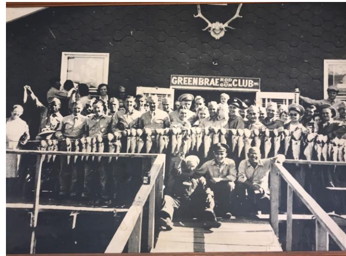
Military Members with a big string of stripers.

Inc. The Rod & Gun operated as a gathering spot for local sportsmen, their families and friends. Many members would show up at the club on Fridays at the end of the work week. It was a fun spot in its heyday and there were often large, festive gatherings with 300 plus people for a Holiday or event. One popular regular event was their fish fry feast where club members could catch the fish of the day right off the dock, bag ducks on the bay, gather clams on the gravelly shores by San Quentin and then cook it all up in the club kitchen for the feast and festivities that followed.