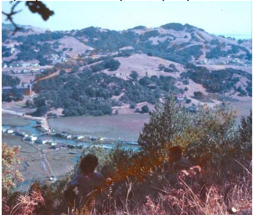
Bon Air Hill, Corte Madera Creek and Arks at site of future Bon Air Bridge 1954

Our house was on Bayview Road at the foot of the hill by Marin General and was situated on the marsh next to Corte Madera Creek. Of course that has been filled in by South Eliseo and all of the medical buildings now. The creek was an asset... Before the Bon Air Bridge was built in 1954, there was a walking and carriage bridge made of wood ... you had to line up the car wheels with the wood slats to get across... very scary, even on foot for a 5 year old, especially when it flooded.