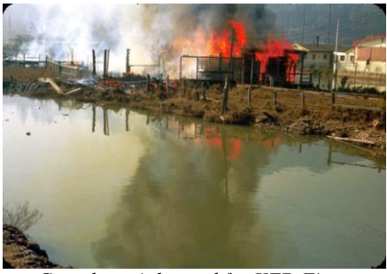
Greenbrae Arks used for KFD Fire Practice 1956

The arks on the Magnolia side of CM creek had garages and docks. Around 1956, they decided to tear them down. The fire department used them for practice. -Katharine (Kit) Hermann