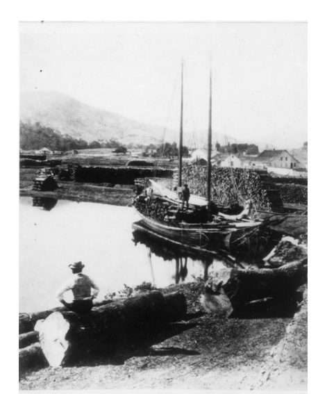
Schooner on Corte Madera Creek Ross Landing