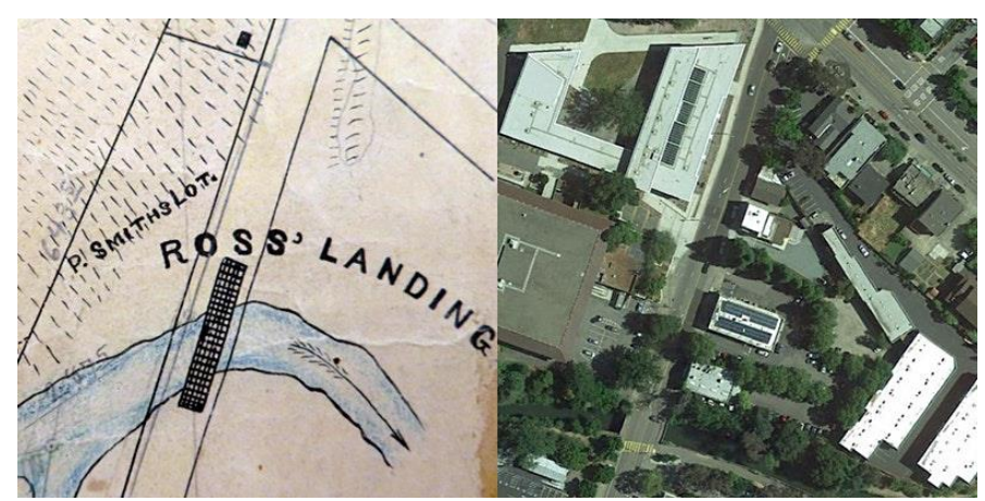
Ross Landing/College Ave.