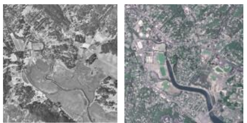
Tidal Marshes of Kentfield Then & Now

Remember, the entire flat area forming the triangle from Corte Madera to College of Marin to Larkspur Landing was impassable marshland. It was not possible, or at least feasible, to cross the 1.5 mile expanse where cars now speed along Highway 101. Early travelers hugged the hills adjacent to the marshes, going around or over the points and deep in to the valleys to keep their feet dry. But as the population of the county increased, the call for roads was loud.