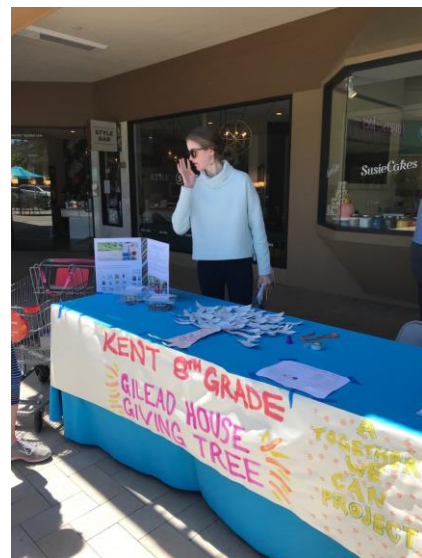
Together We Can...Kent School