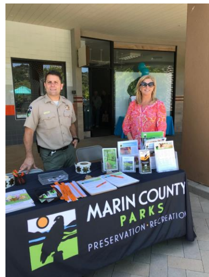
Marin County Parks