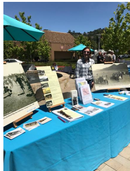
Anne T Kent California Room

May 4th turned out to be a beautiful day for the Community gathering at the Bon Air Center. Over 40 community groups set up tables and displays sharing information about all that is going on in our neighborhoods. The Passport activity engaged most of the kids, and some parents too (we couldn't say no!). A big shout out thanks to Gott's for the ice cream cones and SusieCakes for the delicious cupcakes. Peet's provided coffee for all of the group representatives and volunteers. A very special thank you to the Bon Air Center for partnering with us for this community celebration. The new location of the KGHS Pop Up Store is perfect, providing more opportunities for people to enjoy our historical photos.