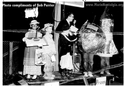
Greenbrae Halloween Parade 1957

Then there was the bowling alley, Greenbrae Lanes. What a great hangout! And how about go-carts near the trestle at Larkspur Landing! Everyone used to pay to go-cart!